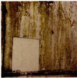
Painted aluminium panel 6 months after treatment with Boracol 5Rh

The borate works in a synergistic way with the quaternary ammonium and is included because the original use for Boracol was in the control of wet and dry rot in buildings.